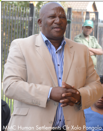
MMC Human Settlements Cnr Xolo Pongolo