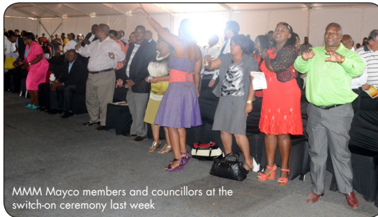
MMM Mayco members and councillors at the switch-on ceremony last week