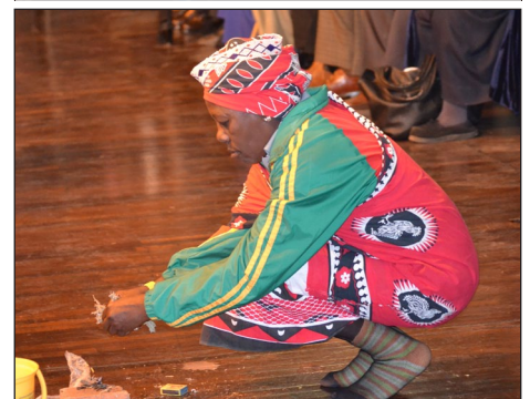
Various denominations and stakeholders were part of the launch.