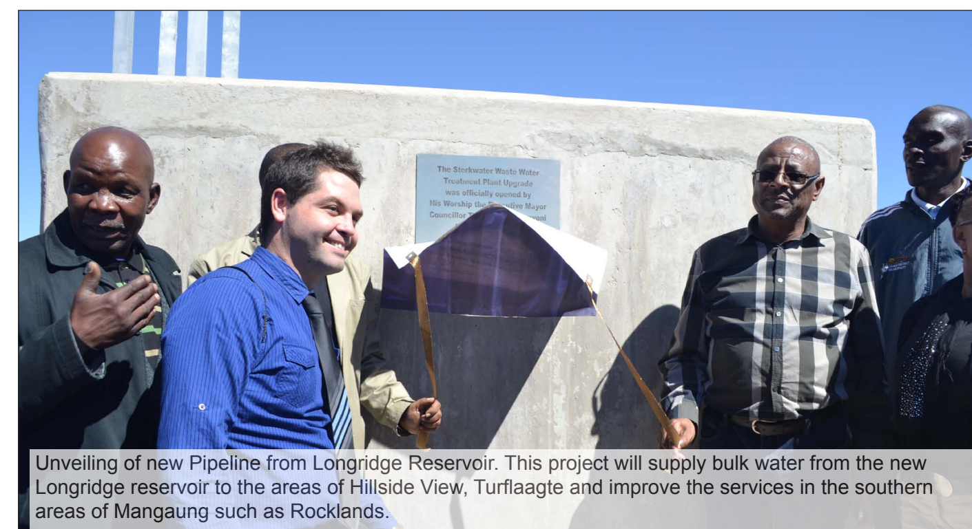
Unveiling of new Pipeline from Longridge Reservoir. This project will supply bulk water from the new Longridge reservoir to the areas of Hillside View, Turflaagte and improve the services in the southern areas of Mangaung such as Rocklands.