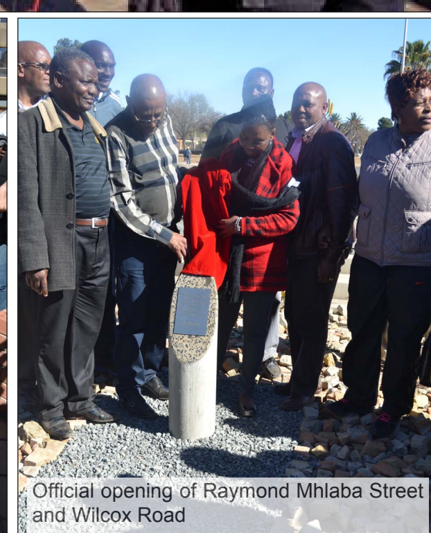
Official opening of Raymond Mhlaba Street and Wilcox Road