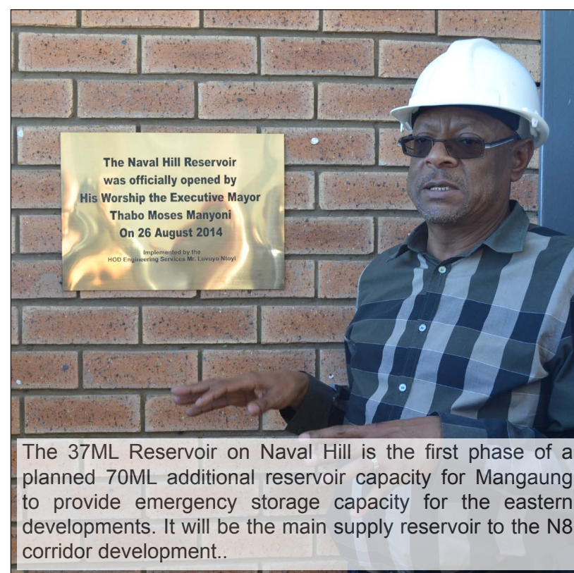
The 37ML Reservoir on Naval Hill is the first phase of a planned 70ML additional reservoir capacity for Mangaung to provide emergency storage capacity for the eastern developments. It will be the main supply reservoir to the N8 corridor development.