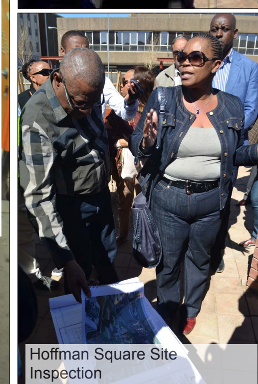
Hoffman Square Site Inspection