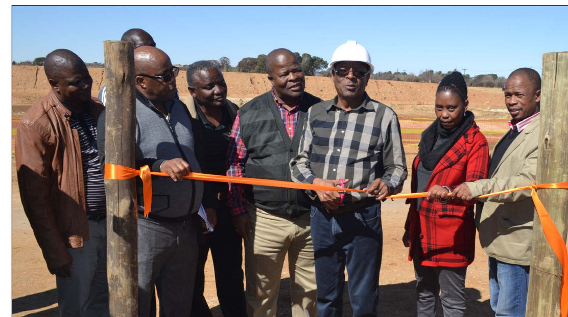
New North-Eastern WWTW: The north-eastern and eastern areas have been identified as priority areas for development – this includes the N8-corridor and Airport Development Node. These areas will be serviced by this new WWTW. Approximately 20500 dwelling units on the short-medium term and a further 27000 on the long term can be developed in the drainage area. Area is also un-locked for light industrial development along the N8-corridor.