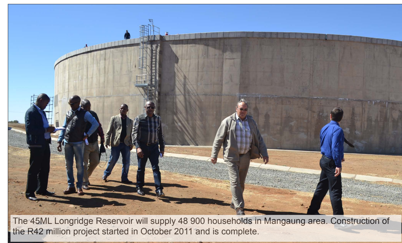
The 45ML Longridge Reservoir will supply 48 900 households in Mangaung area. Construction of the R42 million project started in October 2011 and is complete.

The Executive Mayor and his team will be inspecting the progress on more projects in Thaba Nchu and Botshabelo this week.