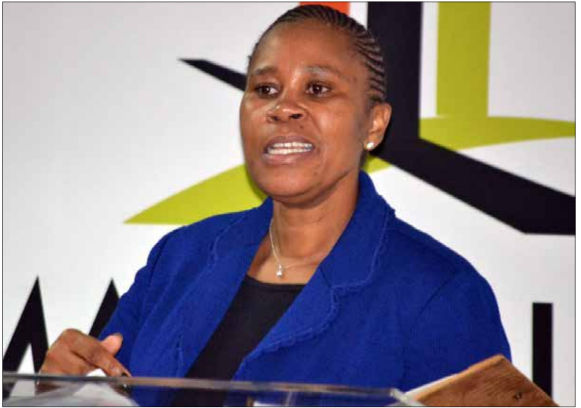
City Manager of Mangaung Sibongile Mazibuko.

The city has identified seven strategically located parcels of land for mixed development, of which three are already undergoing developments. These include Vista Park 2 and 3 as well as Hillside View. These developments are in line with the city's vision of providing decent housing opportunities to the gap market, as well as catering for mixed housing developments as catalyst for integration. Further housing opportunities are provided through the newly renovated and expanded rental stock of the city, the Brandwag development.