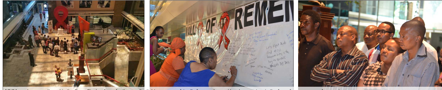
MMM employees gathered in the Bram Fischer foyer for the candle ;light ceremony. A 'wall of remembrance' has been put up in the foyer for messages of support.