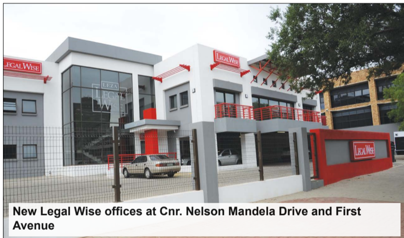
New Legal Wise offices at Cnr. Nelson Mandela Drive and First Avenue