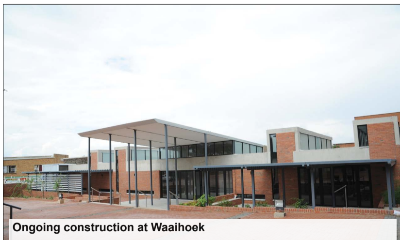
Ongoing construction at Waaihoek