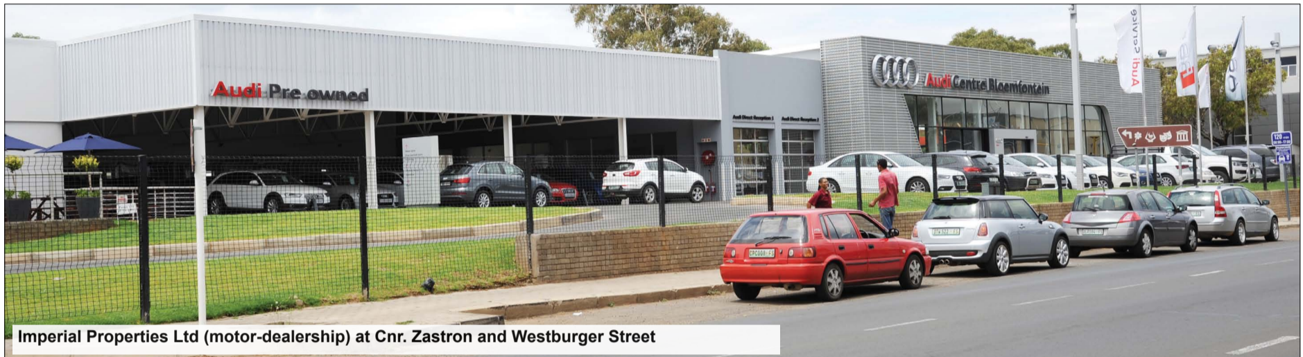
Imperial Properties Ltd (motor-dealership) at Cnr. Zastron and Westburger Street