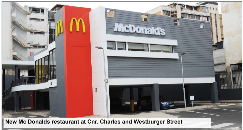
New Mc Donalds restaurant at Cnr. Charles and Westburger Street