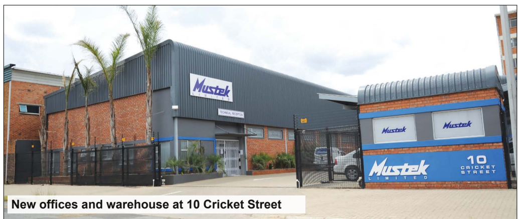
New offices and warehouse at 10 Cricket Street