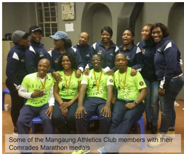
Some of the Mangaung Athletics Club members with their Comrades Marathon medals