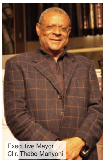
Executive Mayor Cllr. Thabo Manyoni