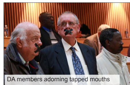
DA members adorning tapped mouths