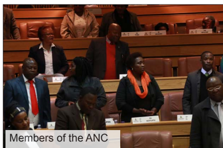
Members of the ANC