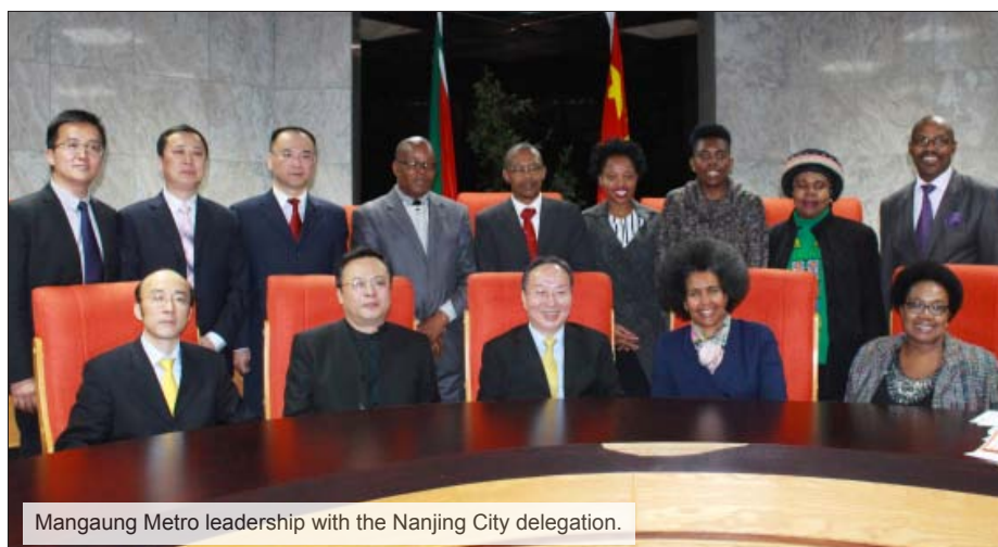
Mangaung Metro leadership with the Nanjing City delegation.