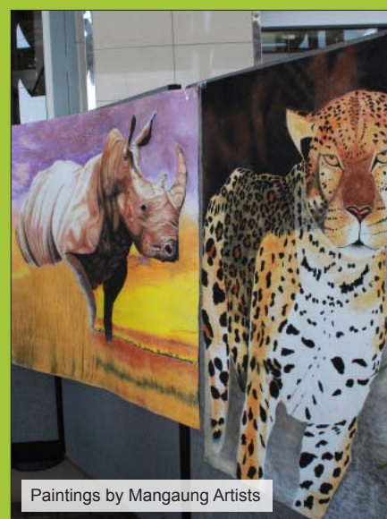
Paintings by Mangaung Artists

As part of their visit to Mangaung, the Nanjing delegation made their