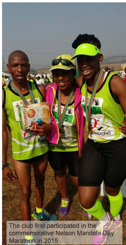
The club first participated in the commemorative Nelson Mandela Day Marathon in 2015

“Zokuthoba. It will humble you.” - This is the slogan for the Comrades Marathon, one which a number of Mangaung Athletics Club members can attest to, having ran the gruelling marathon for the past two years.