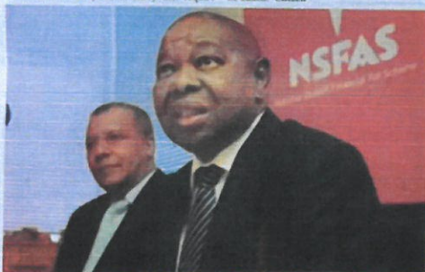
Allegations irresponsible... Minister Blade Nzimande

Nzimande announced that after negotiations with Treasury, the procurement of electronic devices such as laptops, will commence through an open tender system by the end of this week. "We have agreed with National Treasury that given the huge amounts involved in the central acquisition of outstanding tablets, it is better to follow proper procedures than take short cuts, even if there is some delay, so as to properly account for spending of taxpayers' money. We are also finalising the process of verifying which NSFAS students already have acquired devices, in order to avoid mistakenly issuing some students with more than one device per student," he added. Citizen