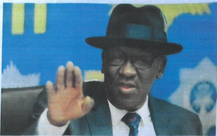
Deeply concerned... Minister Bheke Cele

Police minister Bheke Cele on Wednesday said he was concerned about the murder rate, which had spiked during level three of the lockdown.