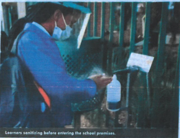
Learners sanitizing before entering the school premises.

At least 56 Gauteng schools were closed during the week after positive cases of COVID-19 were detected. SABC