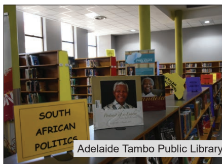
Adelaide Tambo Public Library has different sections for different audiences