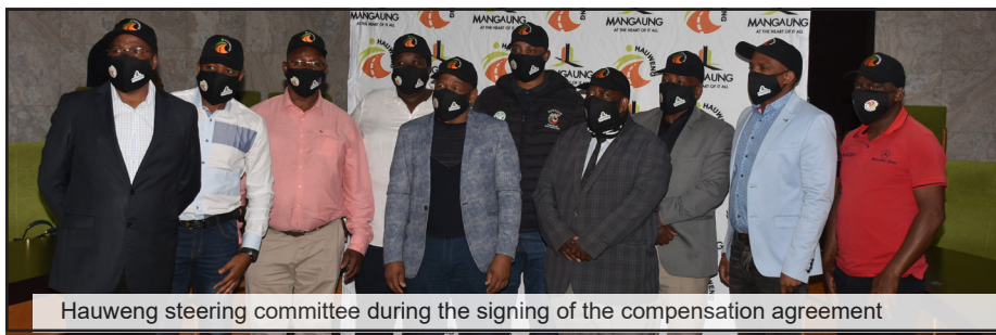
Hauweng steering committee during the signing of the compensation agreement