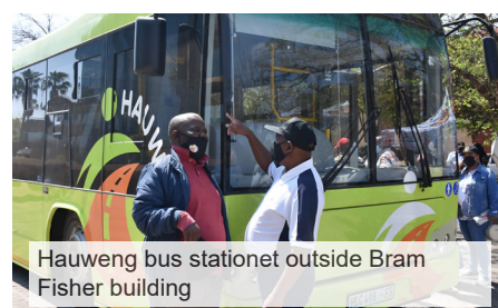
Hauweng bus station outside Bram Fisher building